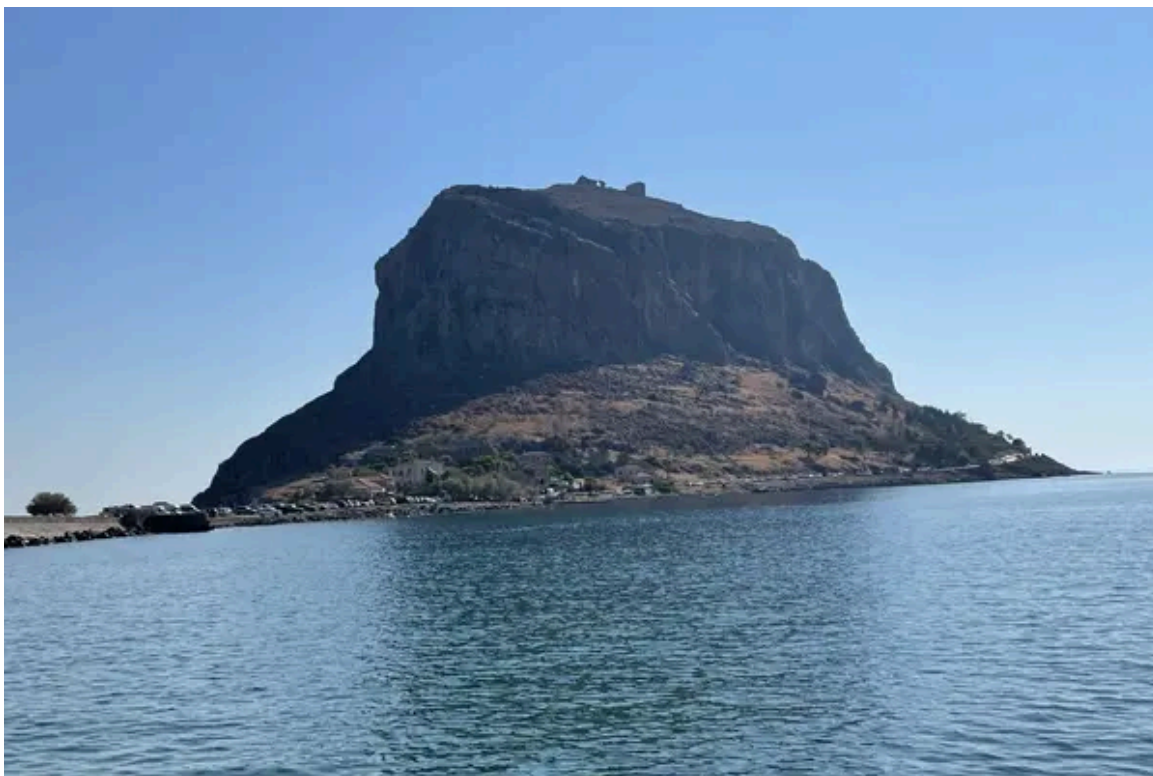
Monemvasia was constructed to be invisible from the mainland to avoid enemy attacks

Just off the mainland, I snorkel over Pavlopetri – the world’s oldest known submerged city. Dating back over 5,000 years, its stone foundations are visible just below the surface. Floating above this ancient grid is quietly moving. No touching allowed – this is a site of preservation.