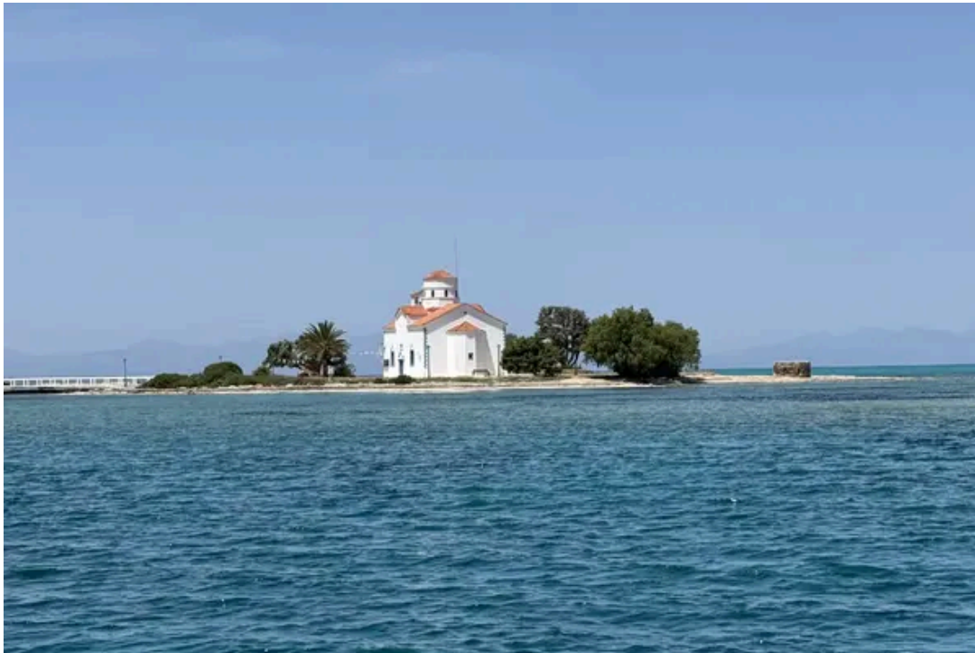
Orthodox church on the small Greek island of Elafonisos