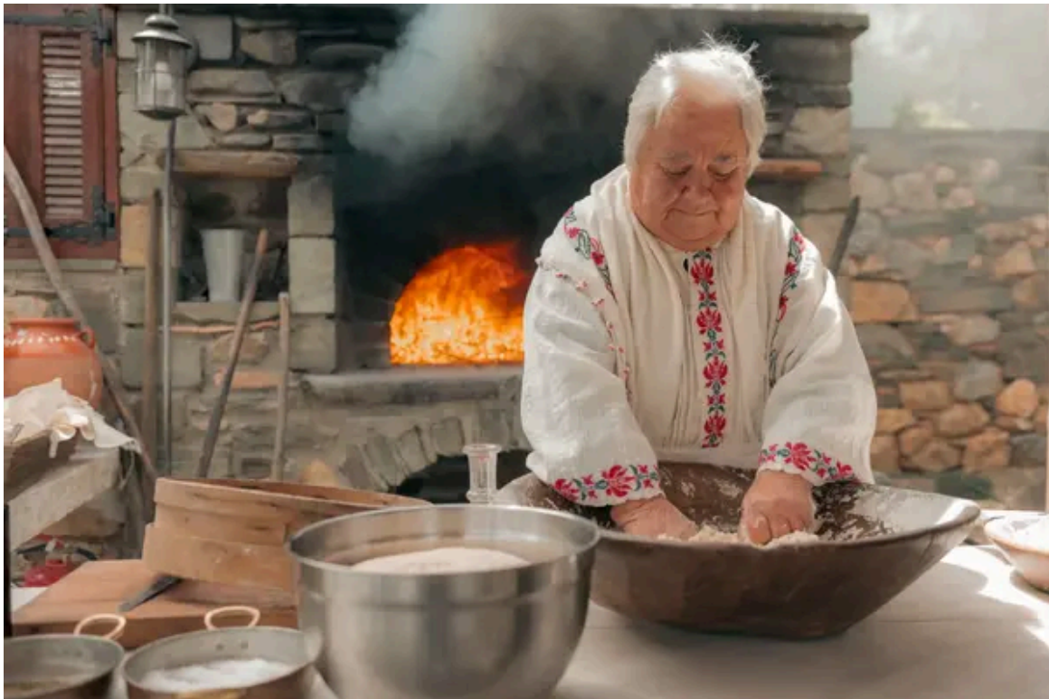
Kinsterna guests are invited to help bake bread in a wood-fired oven

Hidden amongst olive groves and citrus trees, the estate was once a Byzantine mansion. Now it's an elegant complex of warm stone buildings, cobbled paths and cooling fountains. Even in peak season, it's hushed.