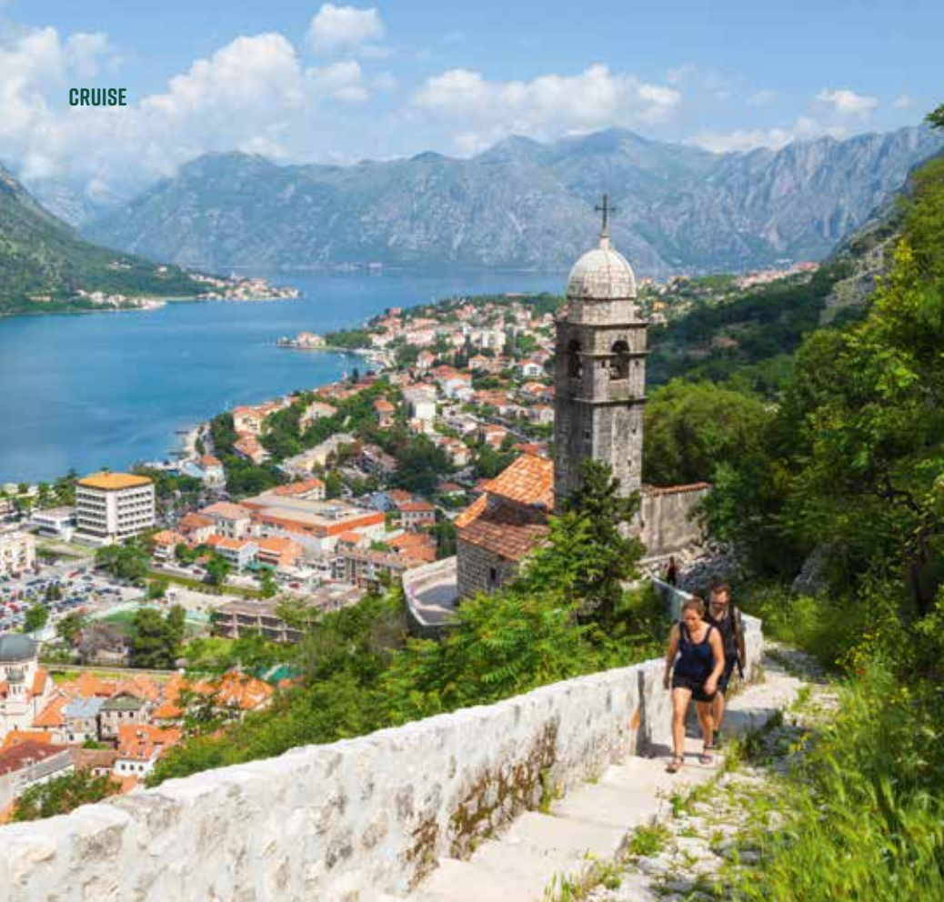
Left: Kotor's Stari Grad (Old Town) and the Bay of Kotor, Montenegro