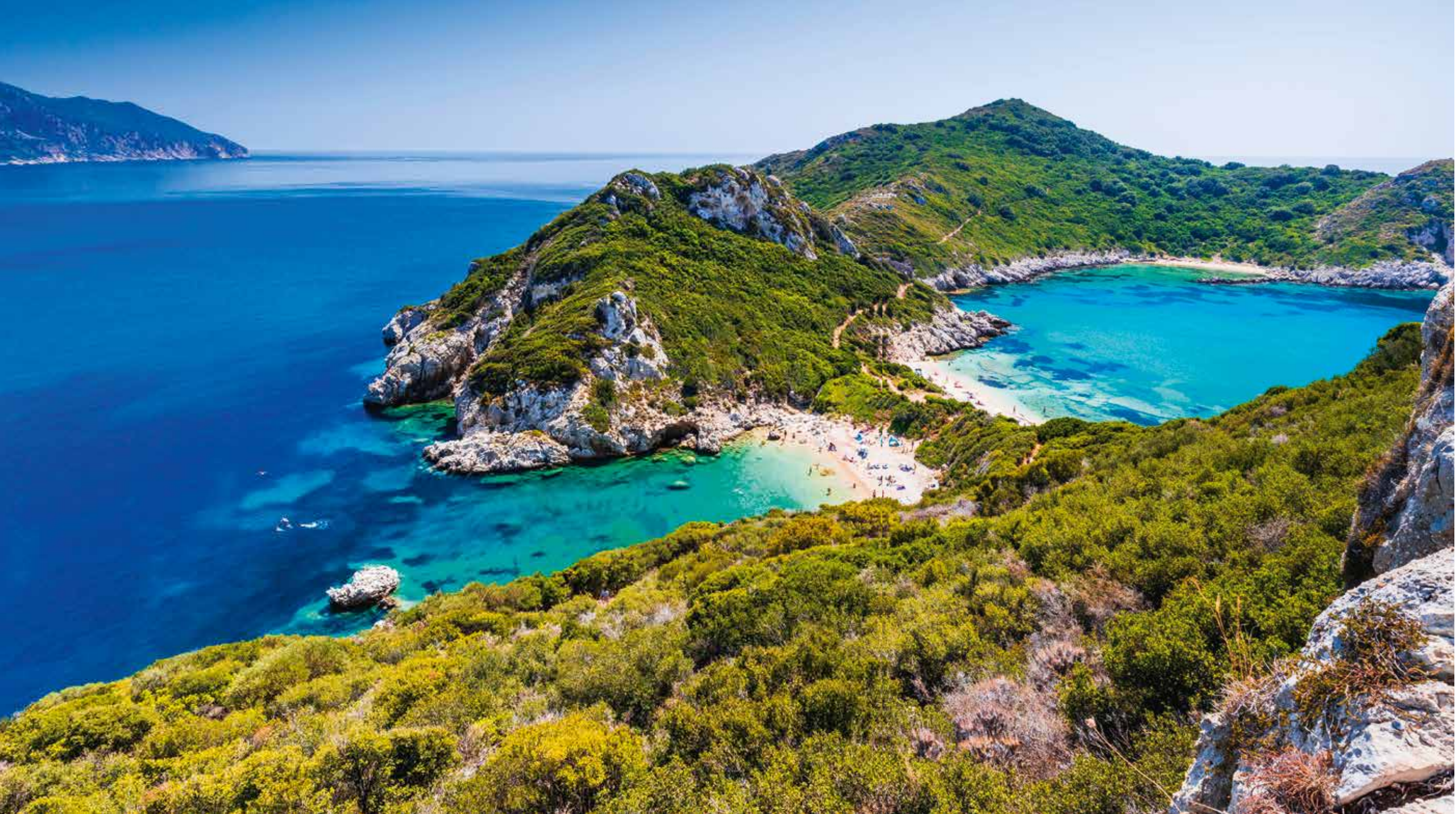
Left: Porto Timoni beach in Corfu, Greece

As a brand, Virgin is renowned for not following a conventional path, and this also filters down to Virgin Voyages, the cruising arm of the company. Its newest ship, Resilient Lady — which sails along the Adriatic Coast to popular Croatian port towns, through Montenegro, then rounding off at a famous Greek island — is the perfect way to experience this beautiful part of the world, along with all that the ship has to offer. From relaxing in hammocks on your Sea Terrace cabin balcony to a choice of over 20 restaurants, and from a tattoo studio to a plethora of nightlife, it's clear Virgin has gone out of its way to create an extraordinary cruising experience. Oh, and it's exclusively adult, too — so all that's left to do is hop on board, relax and experience a world of adventure and excitement.